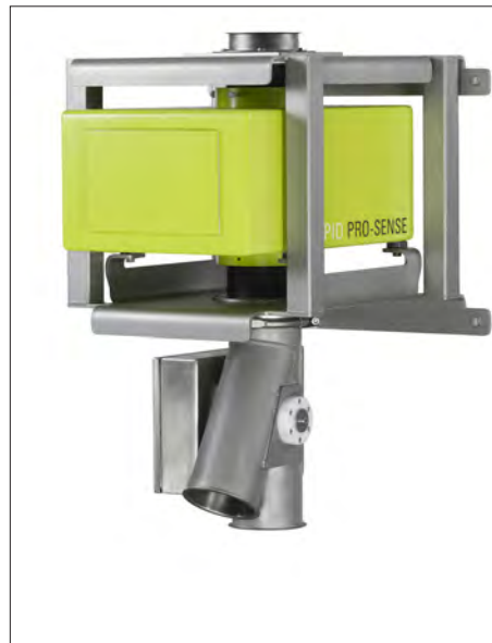
Round reject unit for powder