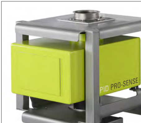
Detection unit with innovative HRF technology

The detection unit with innovative HRF technology (High Resolution Frequency) was developed especially to ensure an optimal scanning sensitivity for all metals. The detection signal is transmitted with a special frequency and evaluated. In addition to ferrous and non-ferrous metals, even smallest particles of non-magnetic stainless steel can now be detected and separated even more efficiently.