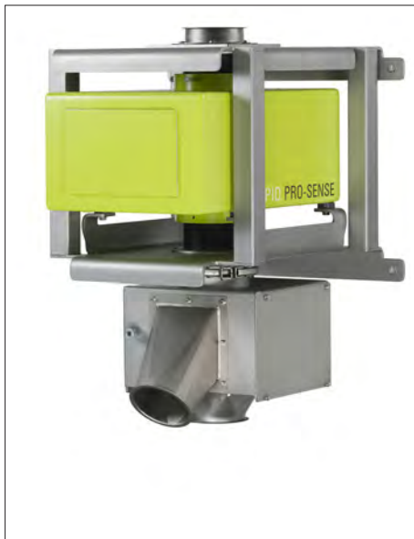
Standard reject unit "Quick-Flap"