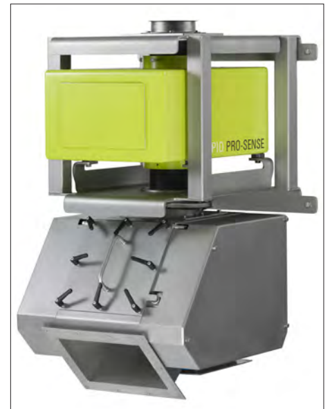
Reject unit with swivel hopper for special materials (Image contains options)