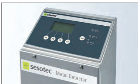
Electronic Control Unit GENIUS+