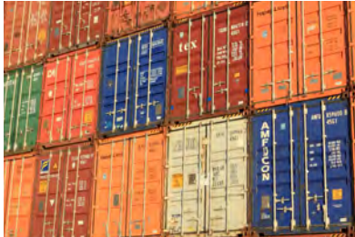
SHIPPING & LOGISTICS