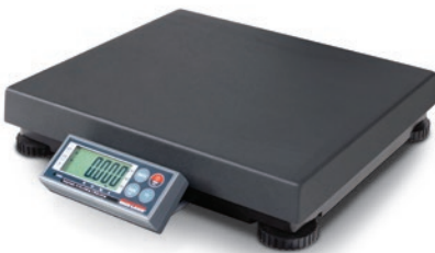
Model BP 1214-S with mild steel shroud

*Available for free download at www.ricelake.com **USB HID interface not available when in the Postal Scale lb/oz mode