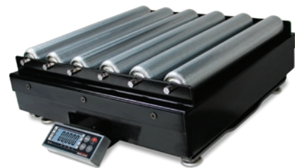
Model BP 2424-S with roller conveyor weight platter