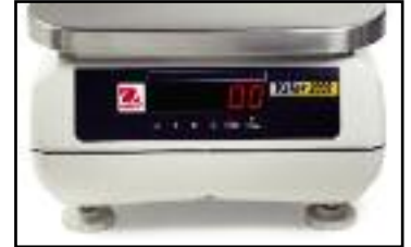
Valor 2000 with rear LED display