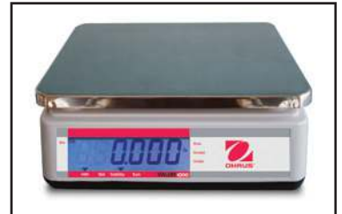
Rear display shown (dual-display models only)