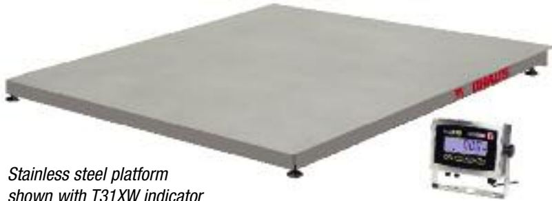
Stainless steel platform shown with T31XW indicator