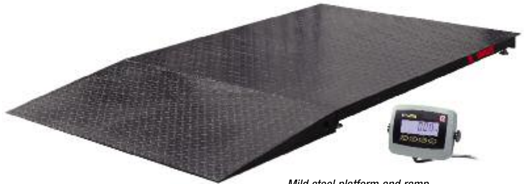
Mild steel platform and ramp shown with T31P indicator